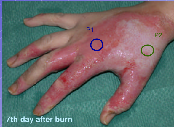
Clear healing tendency on P1, delayed healing on P2

On 15 patient 86 burn wounds were examined. The wounds were clinically evaluated and examined additionally with the O2C (LEA Medizintechnik GmbH). The measurements were conducted within 24 hours and 3 days after the day of burn. The wounds were divided into 4 groups (healing time 1-2 weeks, 2-3 weeks, >3 weeks and operated wounds).